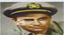
PAUL He killed by the book!