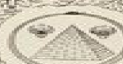
HOUSE OF ELIXIOR