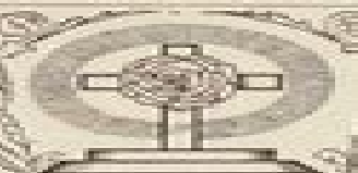
HOUSE SANCTI SPIRITUS FRATERNITAS ROSÆ CRUCIS