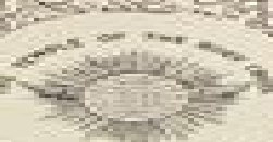
HOUSE OF DOWD