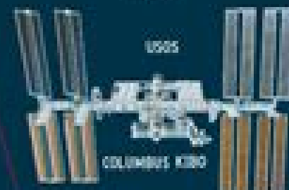
ISSOS COLUMBUS KIBO INTERNATIONAL SPACE STATION