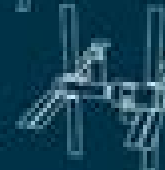
NORTHROP GRUMAN SPACE STATION