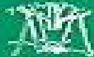
THE UNIVERSITY OF CHICAGO