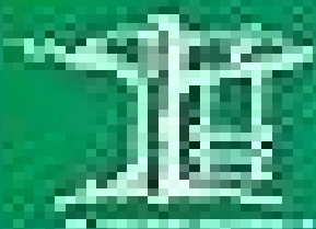
THE UNIVERSITY OF CHICAGO