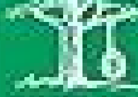
THE UNIVERSITY OF CHICAGO