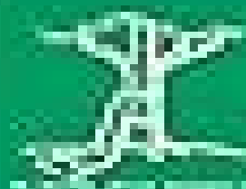
THE UNIVERSITY OF CHICAGO