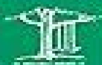
THE UNIVERSITY OF CHICAGO