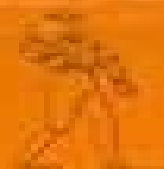
Long Jump High Jump