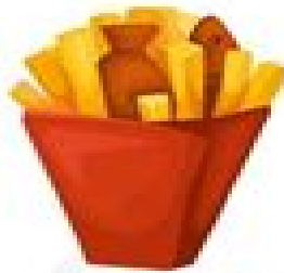
FISH AND CHIPS England