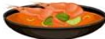
TOM YAM FUNG Thailand