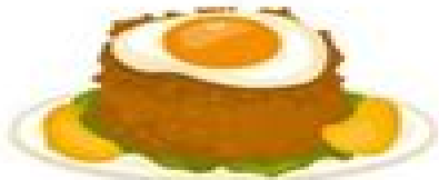
NASI GORENG Indonesia