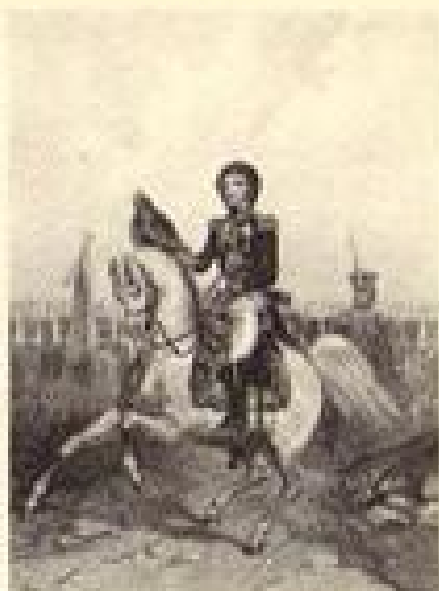
THE AUTHOR OF THE HISTORY OF THE REVOLUTIONARY WAR, AND THE HISTORY OF THE UNITED STATES, AND THE HISTORY OF THE WORLD, AND THE HISTORY OF THE FUTURE.