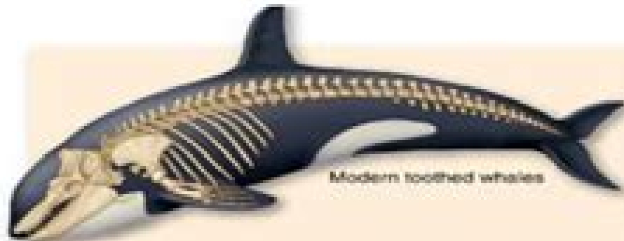
Modern toothed whales

Plodhocetus kassleri's reduced hind limbs could not have aided it in walking or swimming. Plodhocetus swam with an up-and-down motion, as do modern whales.