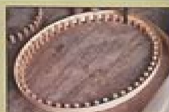
OVALS & CIRCLES