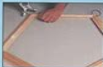
PENTAGONS & HEXAGONS