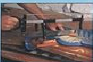
CUTTING THE FRAME