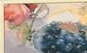
HARD AND SOFT EDGES