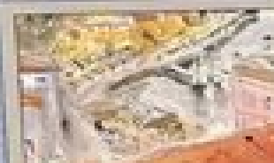
LINE AND WASH