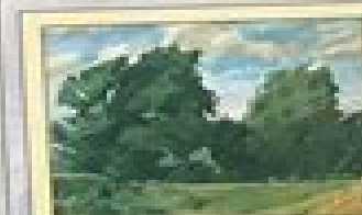
WET ON DRY