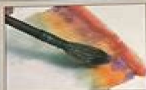
WET IN WET