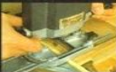
HINGES AND LOCKS