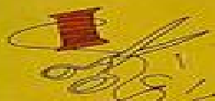
SEWING AND NEEDLECRAFT