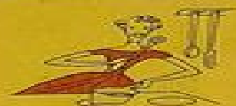
COOKING AND SERVING