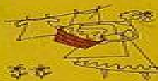
CLEANING, LAUNDERING AND IRONING