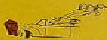
BEAUTY, HEALTH, AND SAFETY