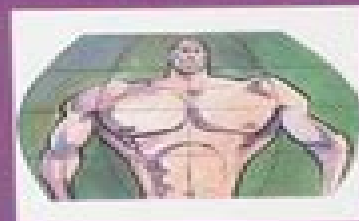
DISTORTION OF FORM