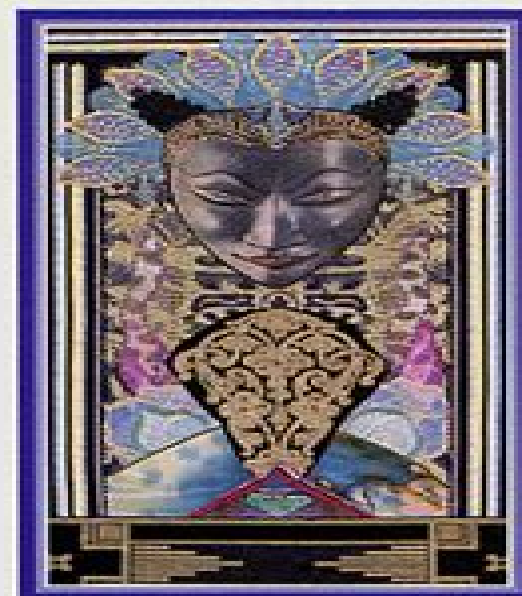
15 THE DEVIL