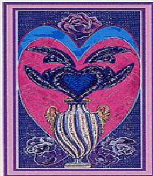
AGE OF HEARTS