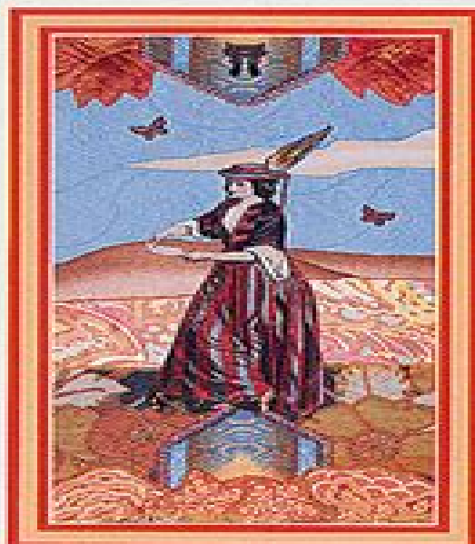
PRINCESS OF WANDS