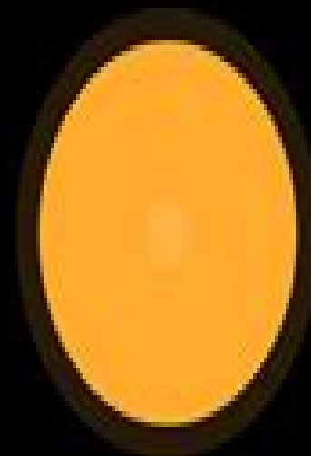
Toliman (Alpha Centauri B)