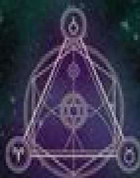
The Passion Fire