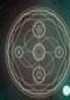
The Rose Flower