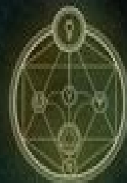
The Lily Flower