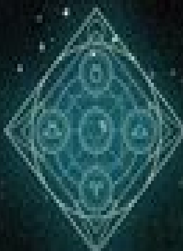
The Blue Bird