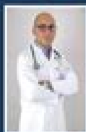
Rechtarzt für Innere Medizin am Charles-Meyer-Krankenhaus in Tunis und Mitglied der Tunesischen Gesellschaft für Innere Medizin. Lehrerin an der medizinischen Fakultät von Tunis.

Die Hyperkalzämie ist eine metabolische Komplikation, mit der der Arzt häufig konfrontiert wird. Das klinische Bild ist polymorph und unspezifisch. Die ätiologische Diagnose ist manchmal schwierig, da es eine Vielzahl von ätiopathogenen Mechanismen gibt, die oft miteinander verbunden sind. Ziel dieser Arbeit war es, die klinischen und biologischen Merkmale der Hyperkalzämie zu bestimmen, ihr ätiologisches Profil in einem internistischen Umfeld zu ermitteln und die Wirksamkeit der symptomatischen und ätiologischen Behandlung sowie die Entwicklung zu bewerten.