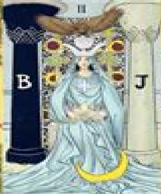
THE HIGH PRIESTESS