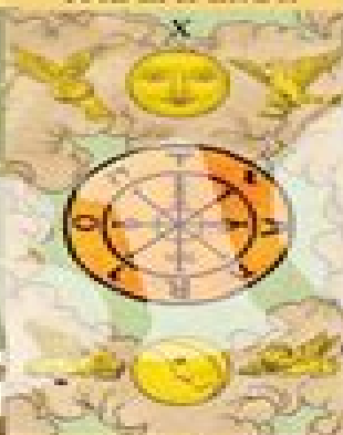
WHEEL OF FORTUNE