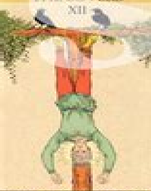
THE HANGED MAN