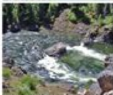
Little Niagara is named for the main drop, which comes from (lower photo), but there are two more parts that require maneuvering (upper photo)

Mile 31.8, Left - Krupper Camp is a sloping sandy campsite with a large tree in the middle of the beach.