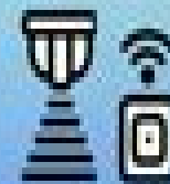
Ambient Motion & Presence Sensing