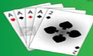
FOUR OF KIND