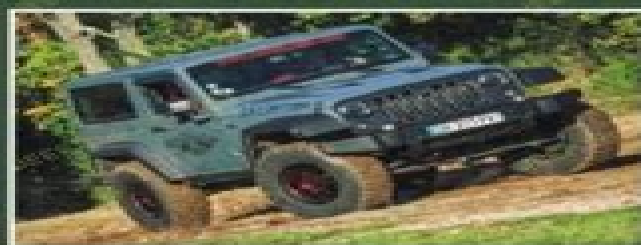
Jeep Wrangler JK 3,6 L V6 Rubicon 285 ch