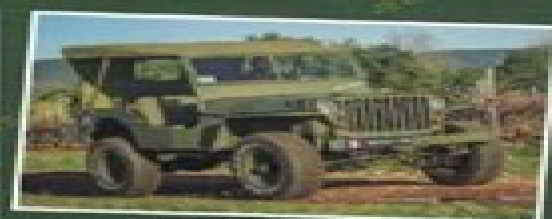
Jeep Hotchkiss M201 de 1956

Mécanique : Restauration d'une remorque Bantam (2 ème et dernière partie)