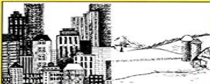
TOWN AND COUNTRY