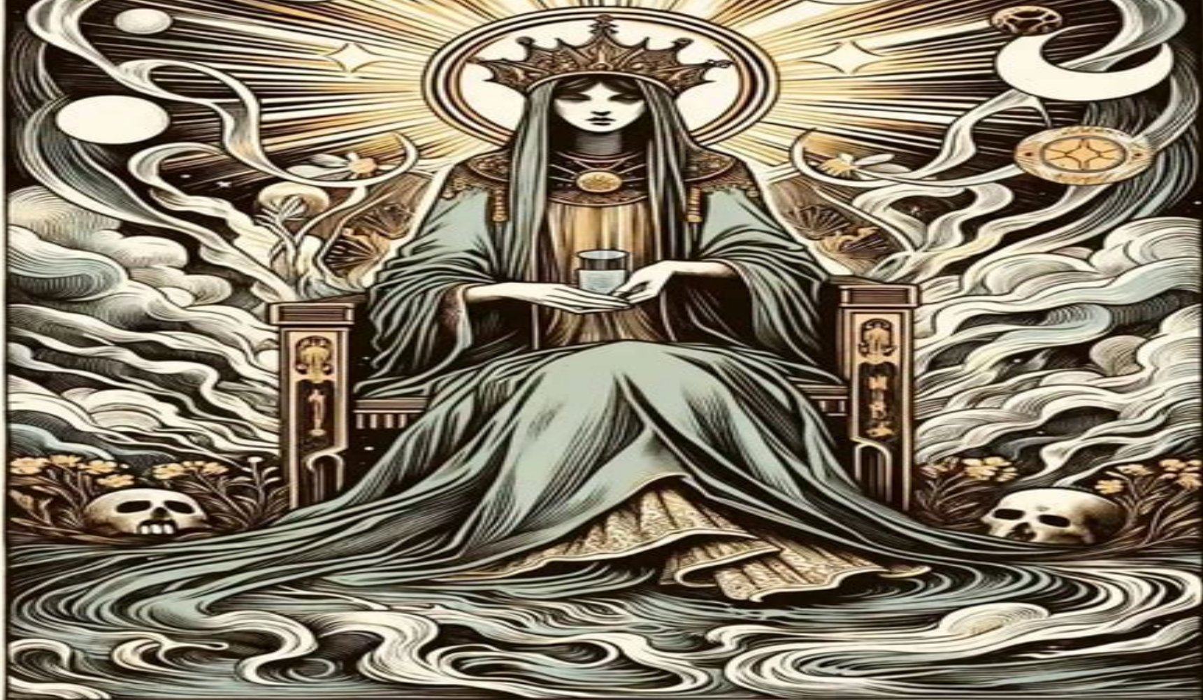
THE HIGH PRIESTESS