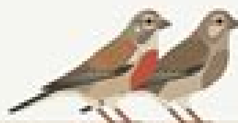
Bluthänfling Sitta europaea