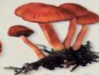
Common Stump Psathyrella