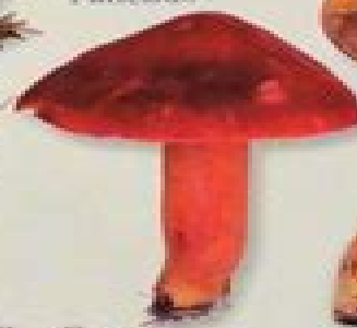
Crimson Wax Cap