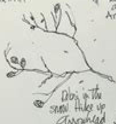
Down in the snow Hike up Arrowhead