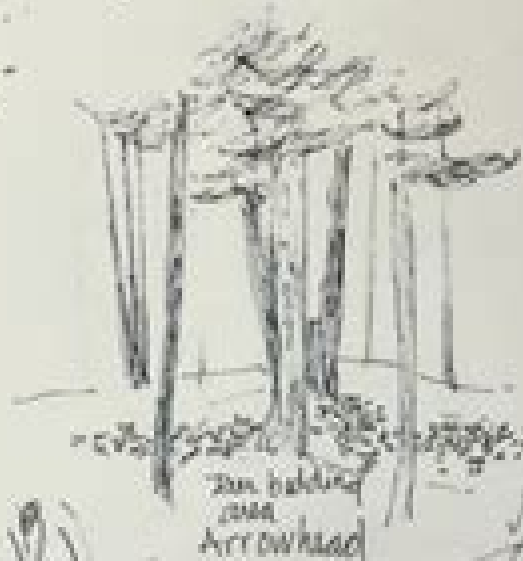
San holding area Arrowhead