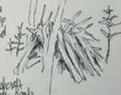
Backwards but in the middle