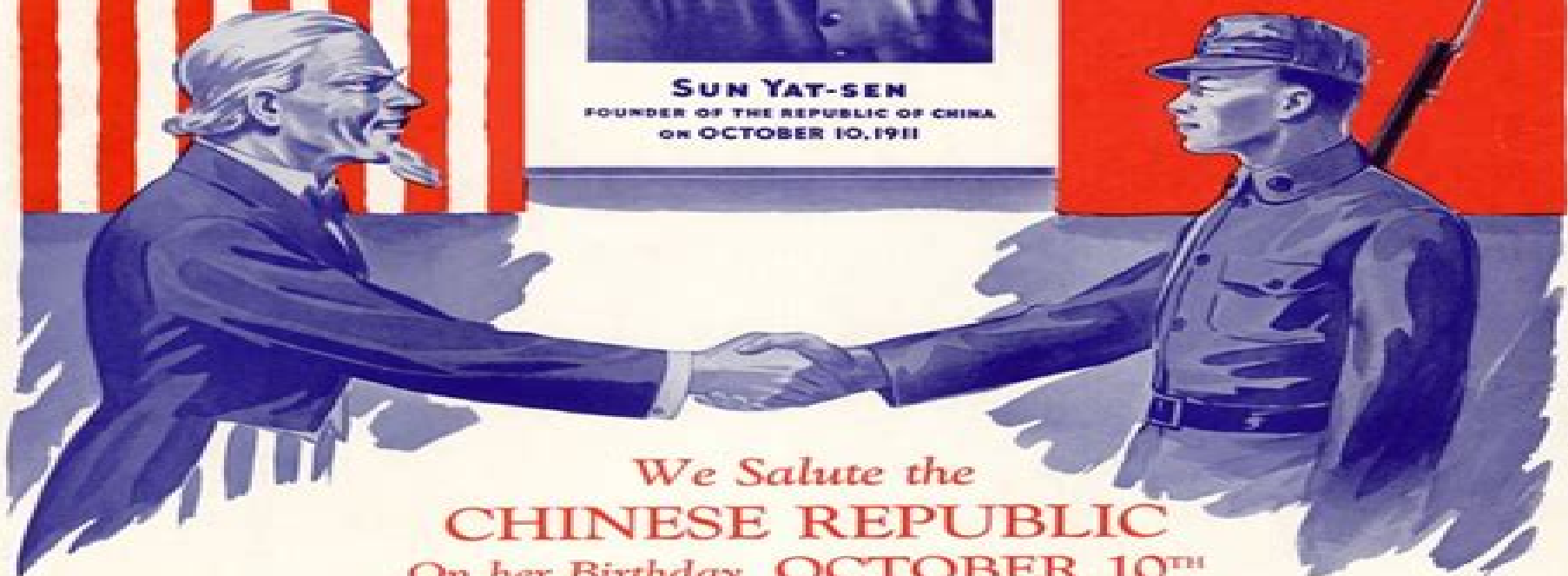
SUN YAT-SEN FOUNDER OF THE REPUBLIC OF CHINA ON OCTOBER 10, 1911

We Salute the CHINESE REPUBLIC On her Birthday OCTOBER 10 TH