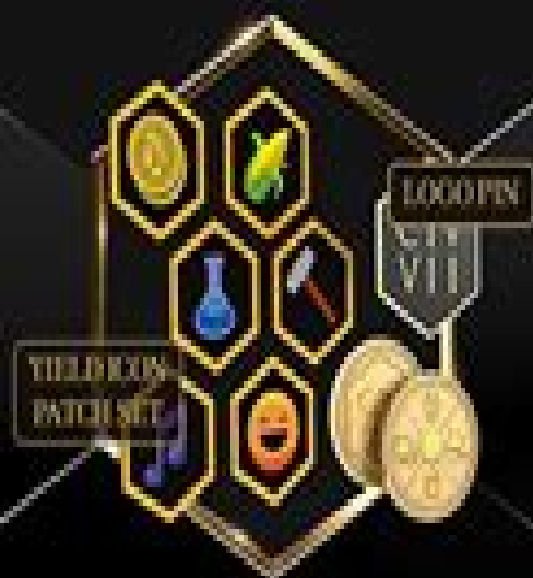
THE HEXIN PATCH SET