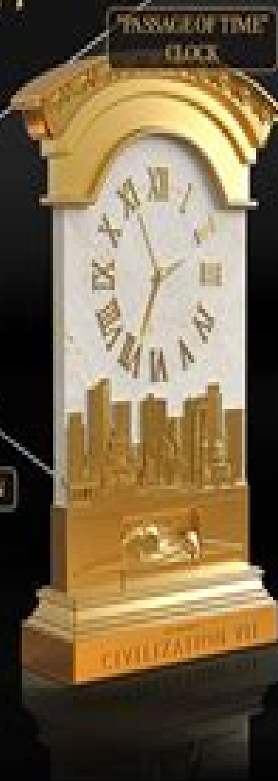
"PASSAGE OF TIME" CLOCK