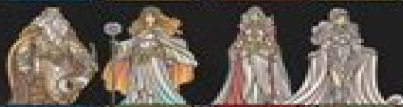
DAHBOG LADA ZORYA MOKOSH