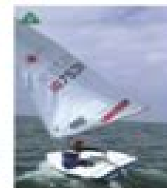
Don't roll the boat