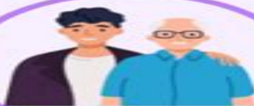
Family & Friends