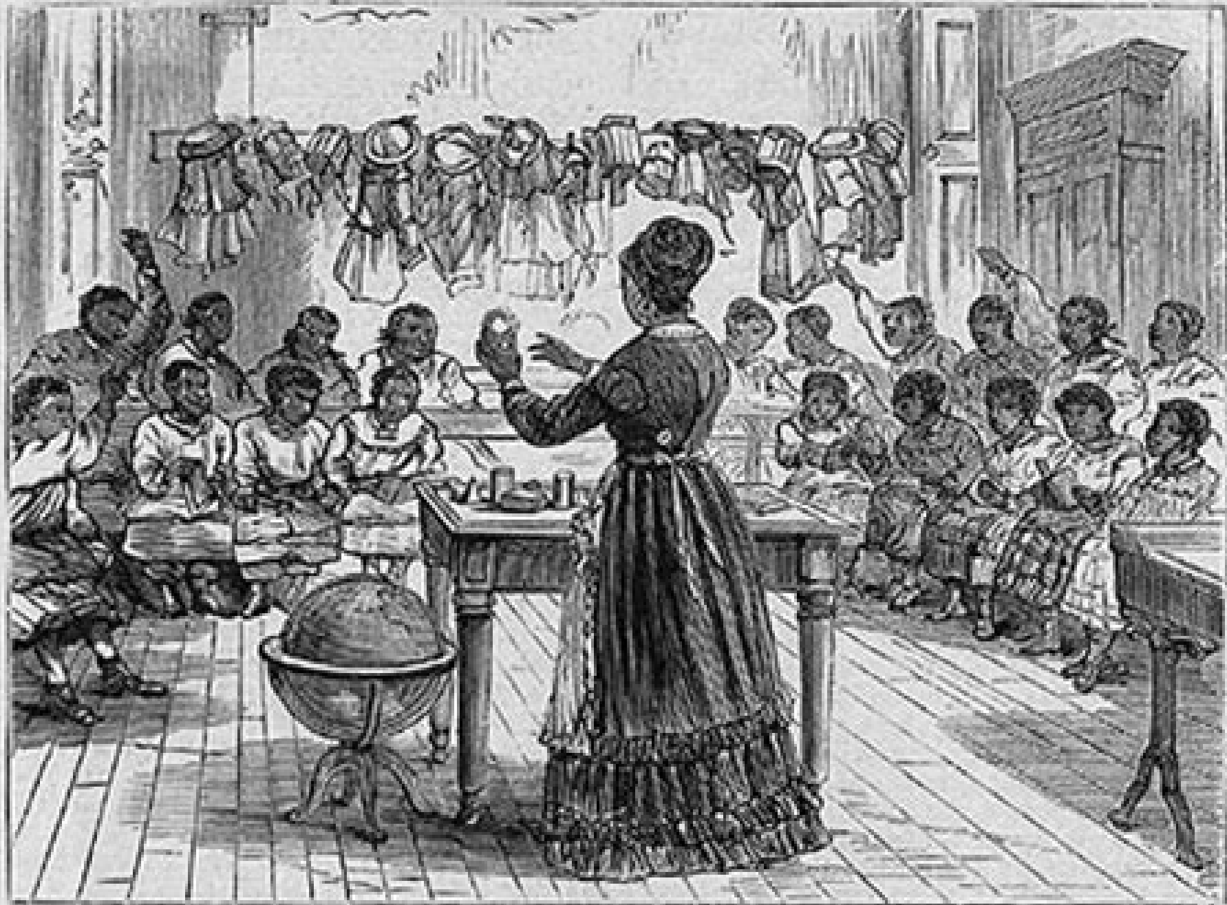
COLORED SCHOOL—OBJECT TEACHING.