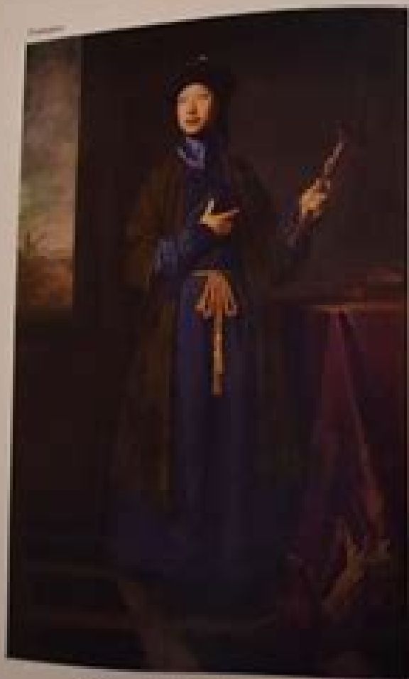
1. The woman in the portrait of the woman of the portrait