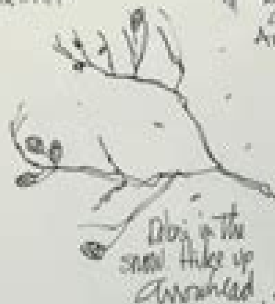
Down in the snow. Hike up Arrowhead