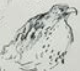
The hawk stayed by the hill. Stopped to take prey and she called out. This hawk later she was still there.