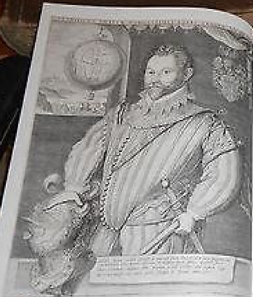
Portrait of Sir Francis Drake, painted by Hans Eworth in 1591. The portrait is a full-length portrait of Sir Francis Drake, showing him in a dark, patterned tunic with a high collar and a sword at his waist. He is holding a small object in his right hand. In the background, there is a globe on a stand and some foliage. Below the portrait is a small rectangular label with text.

WITH AN INTRODUCTION BY THE CURATOR OF THE NATIONAL MARITIME MUSEUM AND A SHORT HISTORY OF THE DRAKE COLLECTION