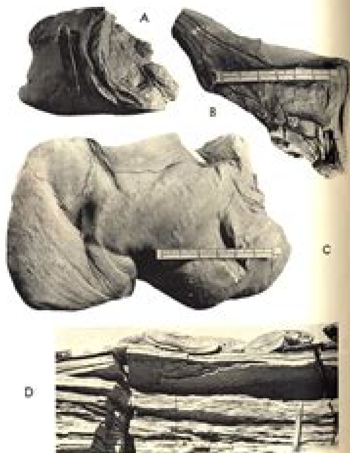
A. Core-and-shell structure from Wapukki member, near Colesburg, Arizona. B. Core-and-shell structure from Holbrook member, near Gap Trading Post, Arizona. C. Core-and-shell structure from Wapukki member, 2 miles east of Wapukki Falls, Arizona. D. Ripple lamination etched on aluminum surface and layer of core-and-shell structure above. Mogul member, east of Black Point, Arizona.