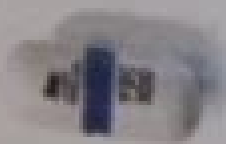
Retrovir 100 mg