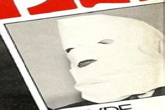
H. MONTGOMERY HYDE