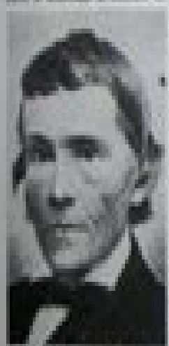
Jefferson Davis President of the Confederate States of America

The Senate was organized by the Confederate States of America. The Senate was composed of 45 members, 25 from the Confederate States and 20 from the Confederate States of America.