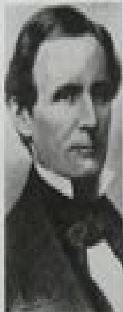
Alexander Stephens Vice President of the Confederate States of America

The Senate was organized by the Confederate States of America. The Senate was composed of 45 members, 25 from the Confederate States and 20 from the Confederate States of America.