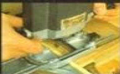
HINGES AND LOCKS