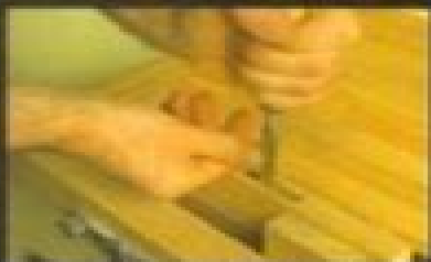
MORTISE AND TENON JOINTS