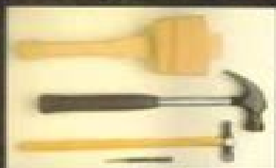
TOOLS AND EQUIPMENT