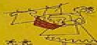
CLEANING, LAUNDRING AND IRONING