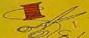
SEWING AND NEEDLECRAFT