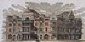
Some Immigrant Headquarters.