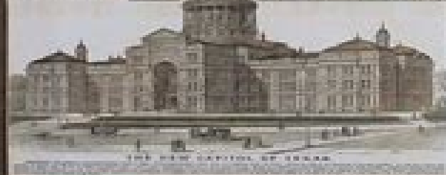
THE NEW CAPITAL OF TEXAS.