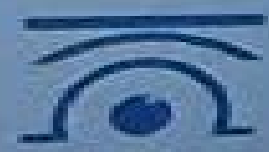
A. Teyssie Musée océanographique de Monaco 1997

L 25548 THE ATOLLS OF MURUROA AND FANGATAUFA