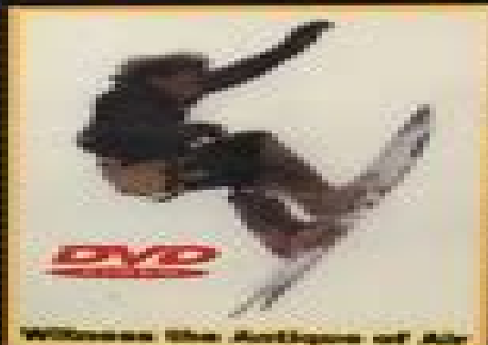
Witness the Artique of Air