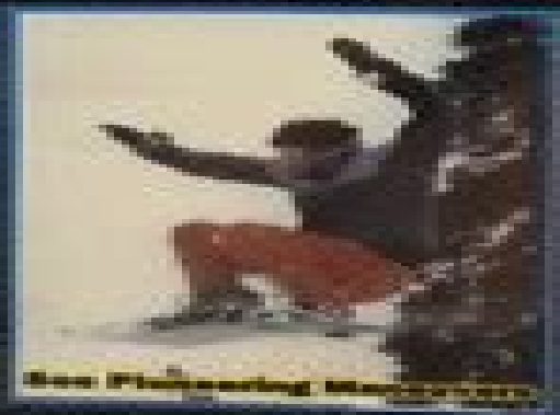
See Pioneering Moves