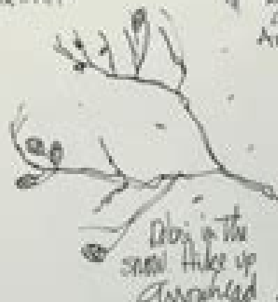
Down in the snow. Hike up Arrowhead