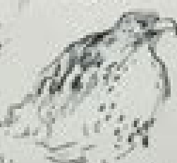
Backwards but in the middle