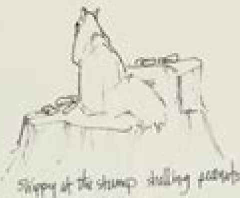
Slipping at the stump, shelling pellets