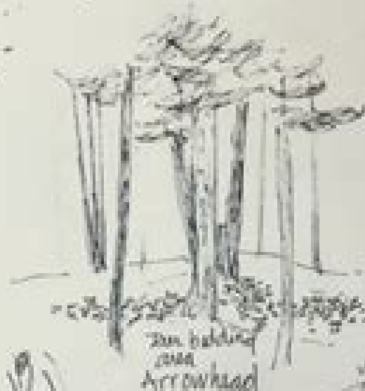
San holding over Arrowhead