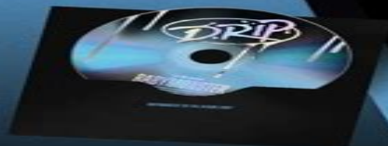
CD (120*120 mm)