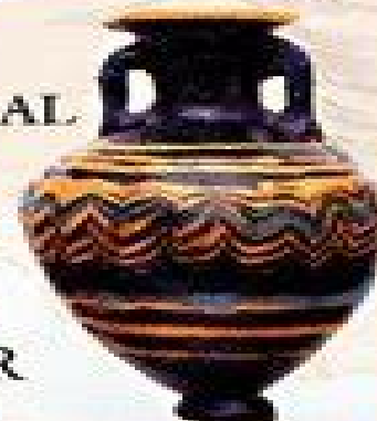
Phoenician glass vase

MICK ASTON & TIM TAYLOR FROM CHANNEL 4'S TIME TEAM