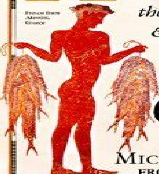
France from Mosaic, Greece