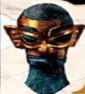
Bronze and gold head from Samothrace