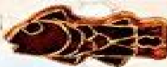
Monolingian bronze brooch