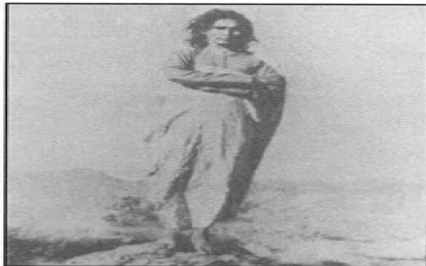
Babaji - Shiva Yogi The Eternal Youth